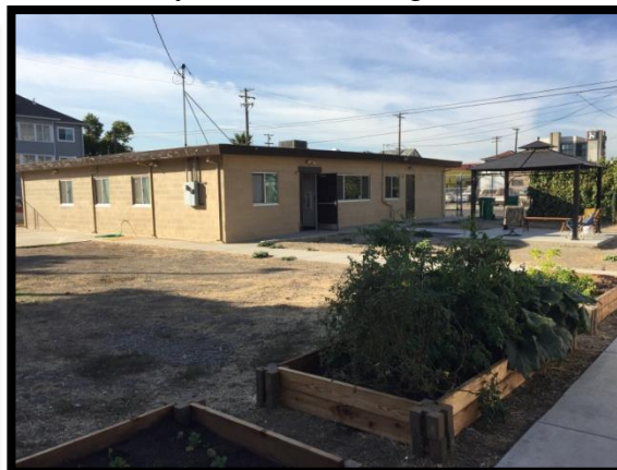
GCRM Room & Client 17 Bed Men's Recuperative Care Center

ANNUAL OPERATING COST: $50,000/bed or $1.2M